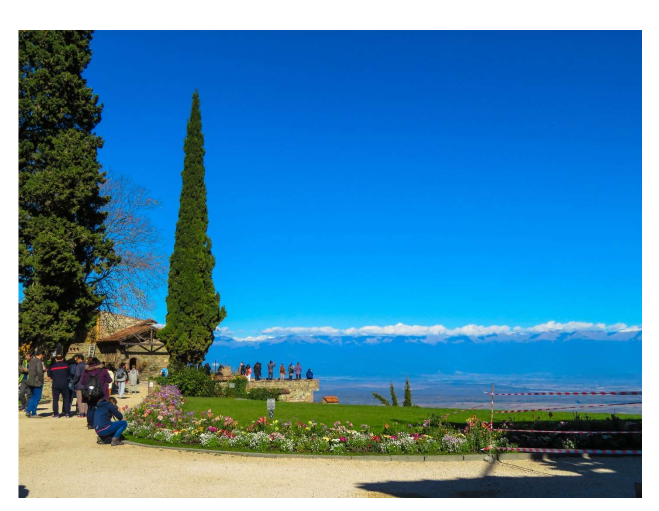
Signagi, a peaceful place which is located in front of Qafqaz Chain Mountains