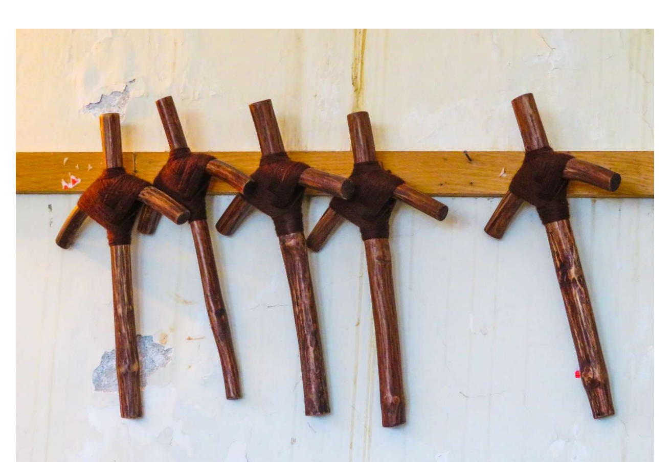
Signagi, Saint nino's cross is made up of two short stick tied with hairs